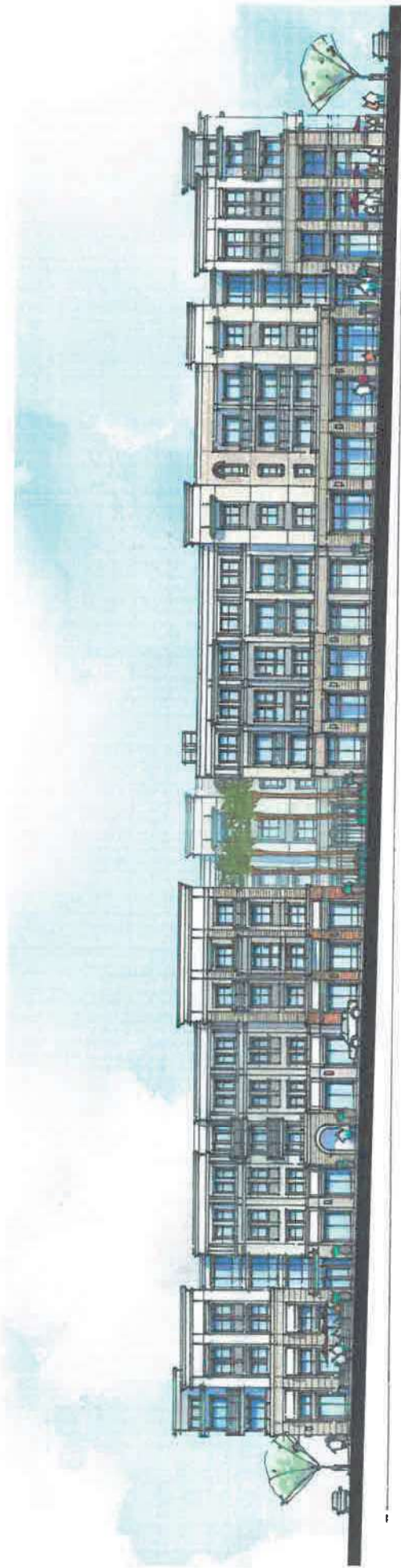
VIEW FROM NORTH EUCLID AVENUE