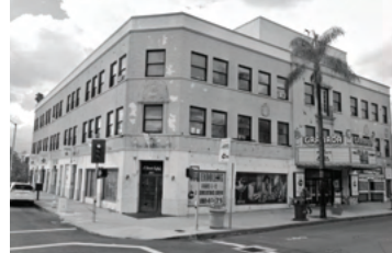
303 N. Euclid