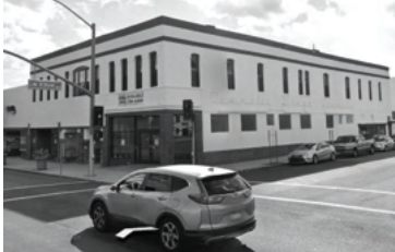
137-141 N. Euclid